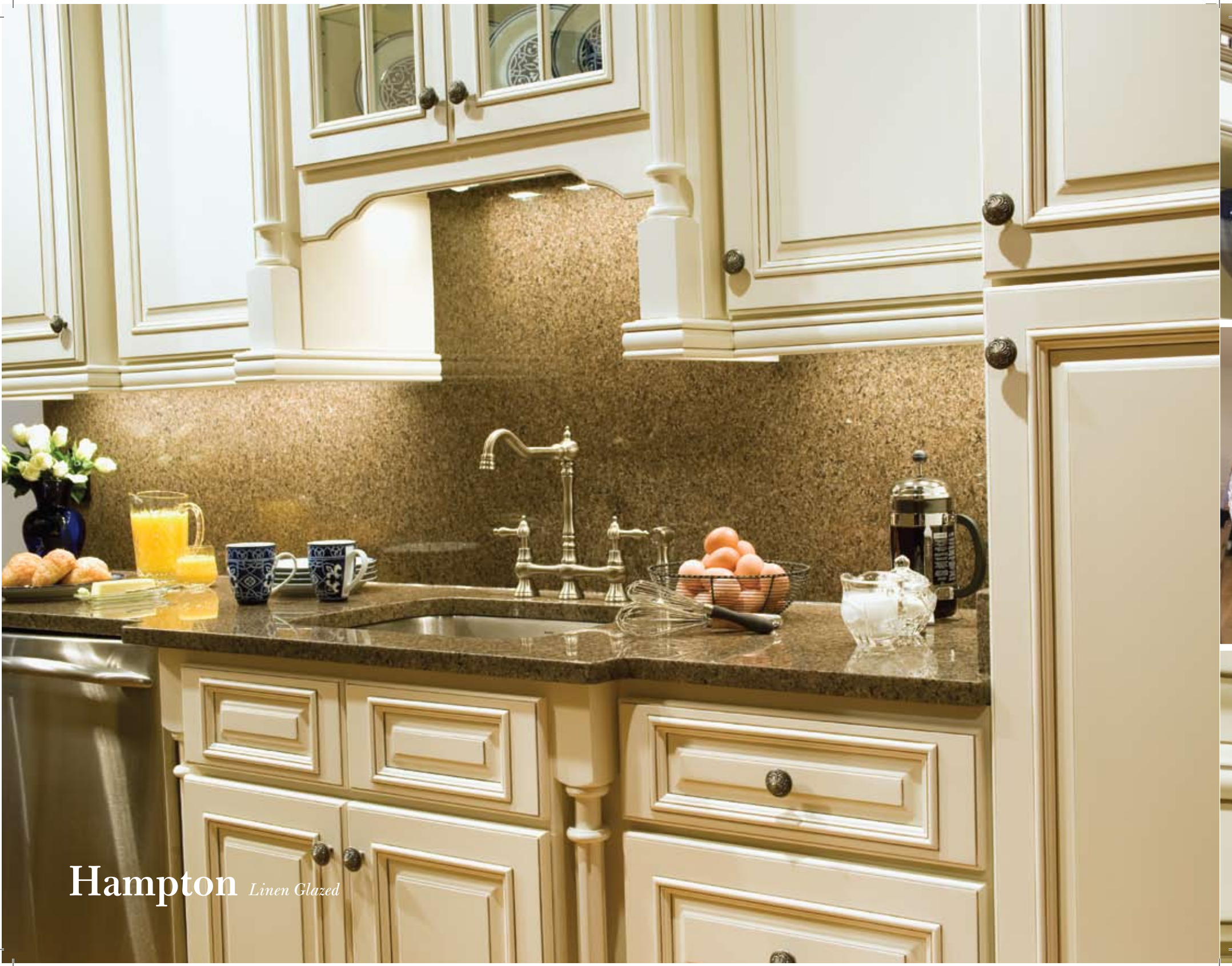
Hampton Linen Glazed